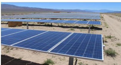
Invenergy developed project, Luning Solar Energy Center, located in Luning, Nevada

Commits to developing projects while minimizing impacts to sensitive ecological resources and ensuring responsible land use